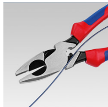
09 11/12 240: fish tape puller in the joint gap