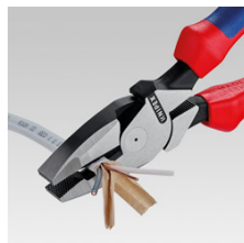
Long cutting edges for cutting flat cables