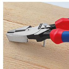
Gripping zone below the joint for powerful leverage