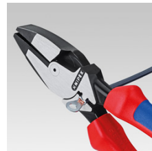
09 11/12 240: universal mandrel crimping area below the joint