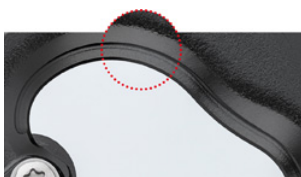
Precision milled and induction hardened cutting edge