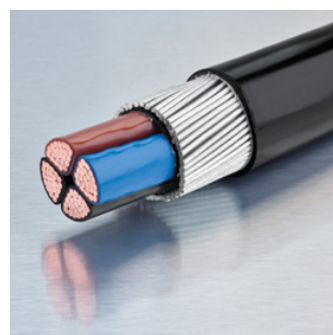
Cross-section of a steel wire armoured cable