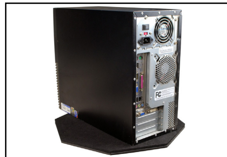
47201 in use