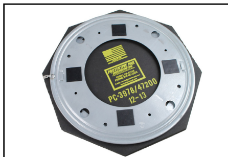
Galvanized Steel Turntable