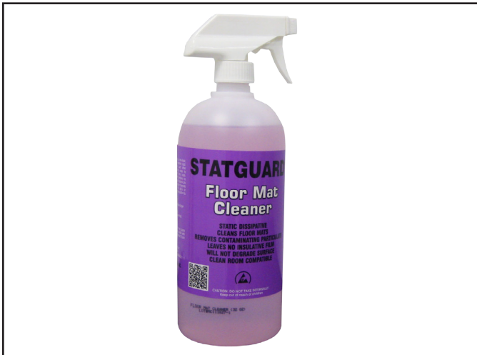
Figure 1. 1 Quart Spray Bottle (10443)