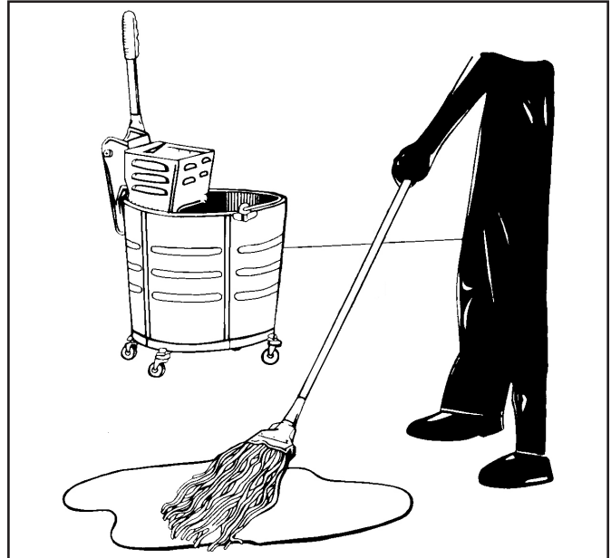
Figure 3. Applying the Statguard® Low Residue Floor Stripper with a cotton mop