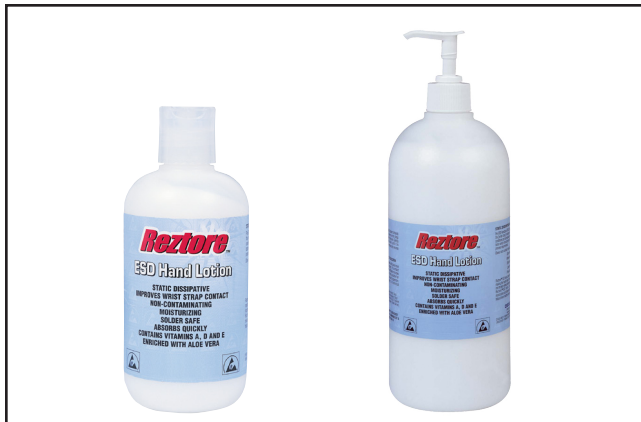
Figure 1. Reztore™ ESD Hand Lotion.