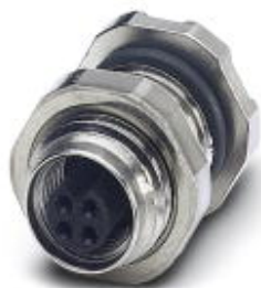
Sensor/actuator flush-type socket, 4-pos., M5, prewall/screw mounting, with straight solder connection

Please be informed that the data shown in this PDF Document is generated from our Online Catalog. Please find the complete data in the user's documentation. Our General Terms of Use for Downloads are valid ( http://phoenixcontact.com/download )