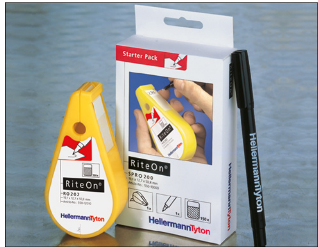
The RiteOn starter pack gets you started right away.