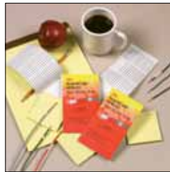
3M™ ScotchCode™ Wire Marker Books