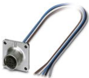
Sensor/Actuator flush-type socket, 5-pos., M12, A-coded, front/square flange mounting, with 0.5 m TPE litz wire, 5 x 0.34 mm 2

Please be informed that the data shown in this PDF Document is generated from our Online Catalog. Please find the complete data in the user's documentation. Our General Terms of Use for Downloads are valid ( http://phoenixcontact.com/download )