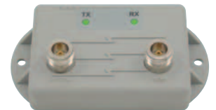
HA2401MG-1000 STYLE A

*These models also available in FCC Certified Amplifier Kits