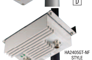
HA2405GT-NF STYLE G