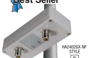
HA2402GX-NF STYLE D