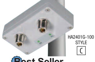
HA2401G-100 STYLE C