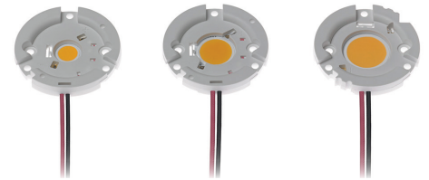
SlimRay™ Pre-Wired LED Array Holders for Lumileds LUXEON*

Simplifying the LED installation process by eliminating the need for labor-intensive hand soldering, low-profile SlimRay™ Pre-Wired LED Holders are ideal for Lumileds LUXEON* and similar next-generation COB arrays