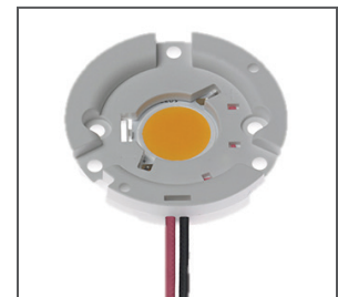
180555-104x 20.00 by 24.00mm Array Holder