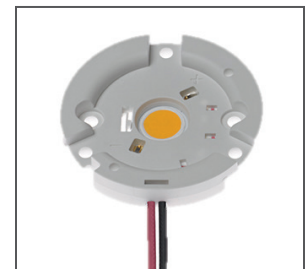
180555-103x 16.00 by 19.00mm Array Holder