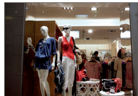
Recessed Downlighting in Residential and Commercial Buildings