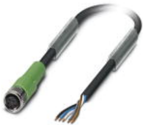
Sensor/Actuator cable, 5-position, PUR, black-gray RAL 7021, free cable end, on Socket straight M8, B-coded, Cable length: 3 m

Please be informed that the data shown in this PDF Document is generated from our Online Catalog. Please find the complete data in the user's documentation. Our General Terms of Use for Downloads are valid ( http://phoenixcontact.com/download )