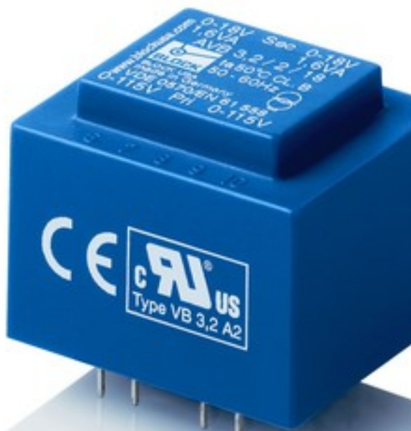
Picture shows AVB 3,2/2/18