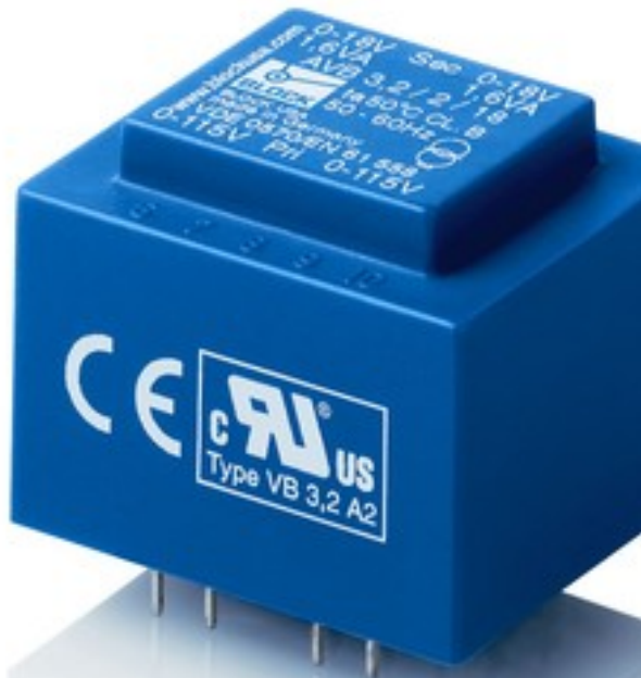
Picture shows AVB 3,2/2/18