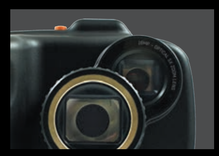
Fully featured compact digital SLR

Forget delicate touch screens and small buttons. Your job requires gloves to perform and your camera needs to perform with gloves.