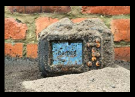
Tough, like you

Take and review images in any weather, day or night in complete confidence.