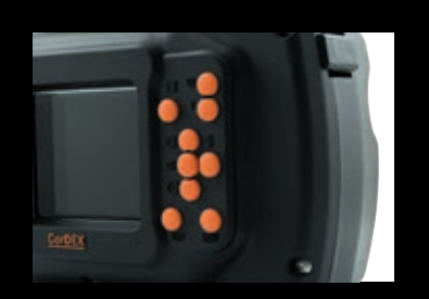
Soft touch buttons for ease of use