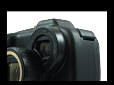
Powerful LED flash for low light imaging