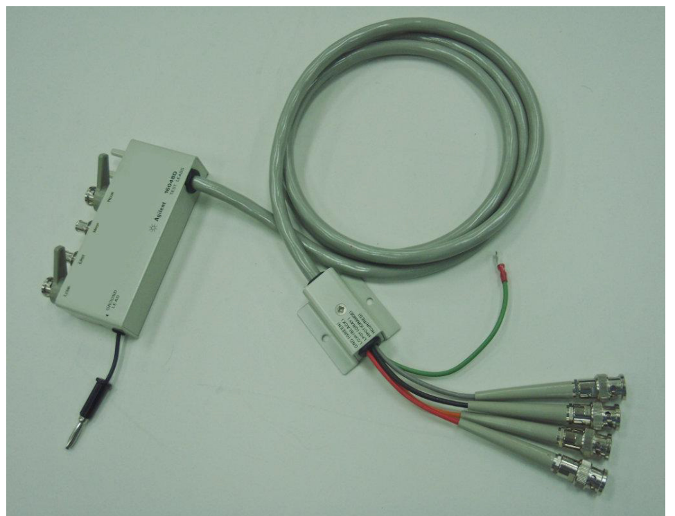
Figure 1-1 Product Overview

The 16048D consists of a direct attachment, 4-terminal pair type fixture which is equipped with four BNC (m) terminated-coaxial test leads. These test leads are used to attach user-fabricated test fixtures. DC bias levels of up to \pm 42 V can be applied to the 16048D. Cable length is 2 meter. The 16048D is shown in Figure 1-1.