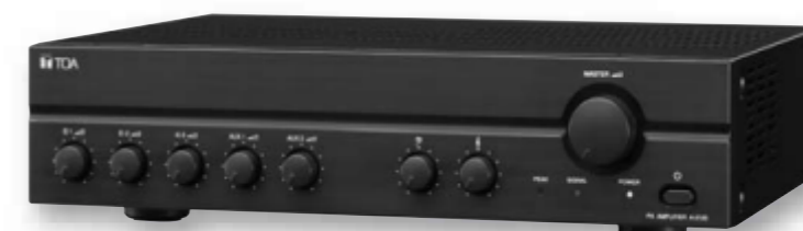
A-2030/2060/2120/2240 Mixer Power Amplifiers