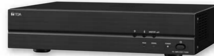
P-2240 Booster Amplifier

Offering high-end performance at affordable cost Think of TOA when you need amplifiers for commercial audio applications