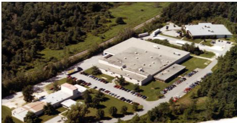
Harbour Industries Facility in Shelburne, Vermont.

Harbour is an ISO 9001-2008 facility which is fully compliant to the RoHS, REACH, DFARS, WEEE, ELV and BFR Directives.