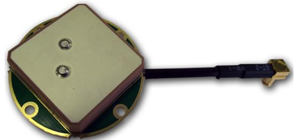
TW1600 Dimensions (mm)