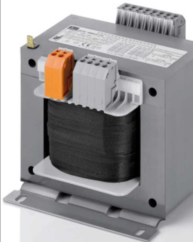
Picture shows USTE 1000/2x115