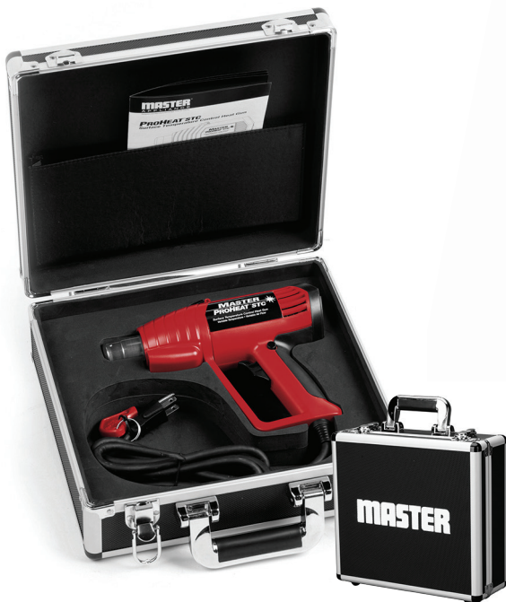
35542 ProHeat STC Storage Case