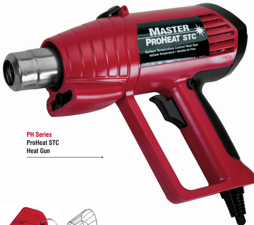
PH Series ProHeat STC Heat Gun