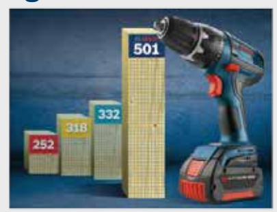
Longest Run Time Over 500 screws per charge<sup>†</sup>