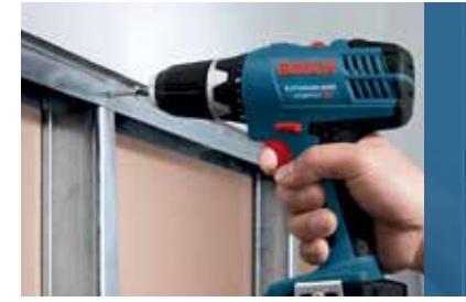
Compact Great for light-duty applications