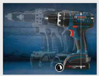
Most Compact Size and Weight