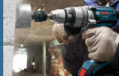
Brute Tough™ Great for medium to heavy-duty applications