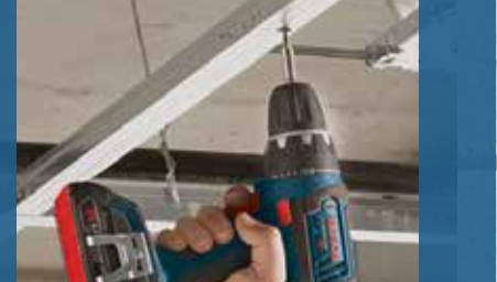
Compact Tough™ Most versatile for light to medium-duty applications