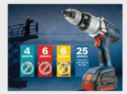
Most Durable Survives 12 ft. drops on solid concrete