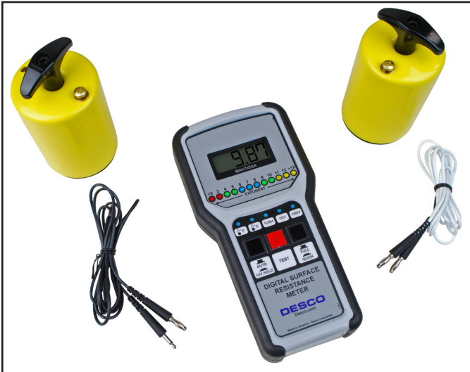
Figure 1. Desco Digital Surface Resistance Meter Kit