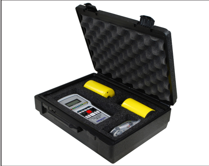
Figure 2. Desco 19787 Digital Surface Resistance Meter Kit