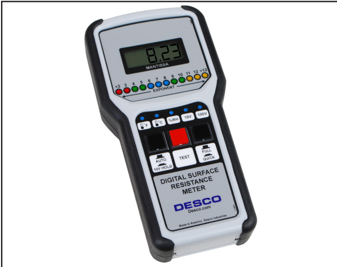
Figure 3. Desco 19788 Digital Surface Resistance Meter