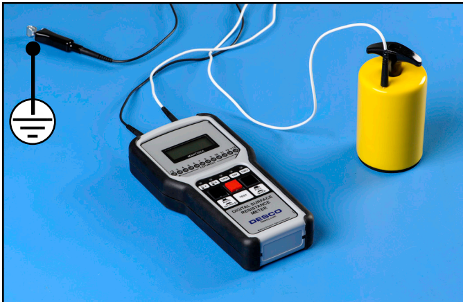
Figure 5. Rtg test setup

If the measurement is outside acceptable limits, clean the surface with an ESD cleaner containing no insulative silicone such as Reztore™ Antistatic Surface & Mat Cleaner , and re-test to determine if the cause of failure is an insulative dirt layer or the ESD worksurface material.