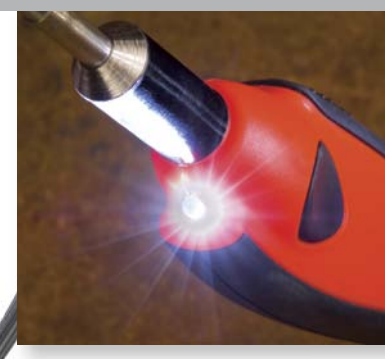
Bright LED illuminates the work, so its easier to make perfect solder joints