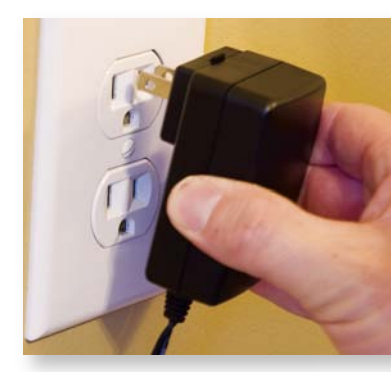
Patented power supply design helps give this iron outstanding performance

"The Weller Pro Series iron delivers unprecedented performance in a consumer tool.