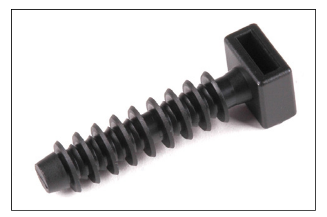
LOK01, LOK01B, LOK01S fixing bases.