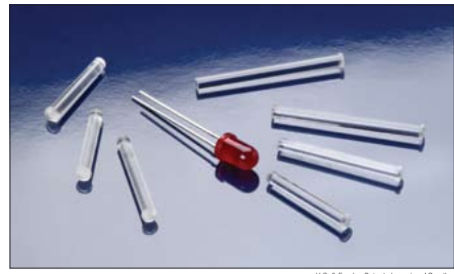
U.S. & Foreign Patents Issued and Pending