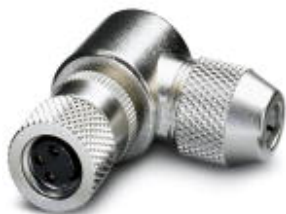
Connector, 3-position, shielded, Socket angled M8, A-coded, Solder connection, Knurl material: Nickel-plated brass, External cable diameter 3.5 mm ... 5 mm

Please be informed that the data shown in this PDF Document is generated from our Online Catalog. Please find the complete data in the user's documentation. Our General Terms of Use for Downloads are valid ( http://phoenixcontact.com/download )