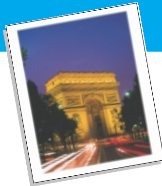
PHOTO PHOTO PAPER Glossy Premium Weight