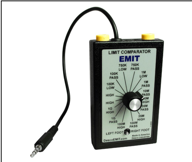
Figure 1. VER-29205 Limit Comparator