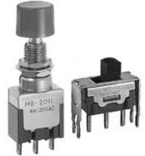
Changes for MB Pushbuttons & MS Slides, Among Other Series

The location of production will change for EB and MB Pushbuttons, and CS and MS Slides from the China factory to the Philippines factory. The lot number on the side of the switch cases will have a dot mark above the second digit instead of the first digit. The box in which the switches are packed for shipping will now read "PHILIPPINES FACTORY" instead of "CHINA FACTORY." All of these modifications will apply to custom as well as standard products.