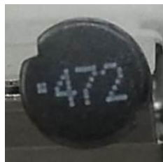
Marking with Inkjet-Printing