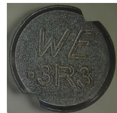
Marking with Laser-Printing (with "WE" signature)