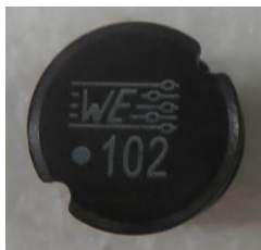
Marking with Pad-Printing (with WE-Logo)