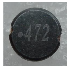
Marking with Laser-Printing