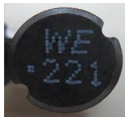
Marking with Inkjet-Printing (with "WE" signature)