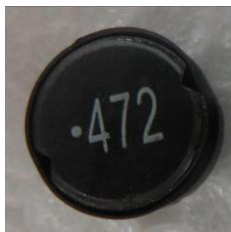
Marking with Pad-Printing