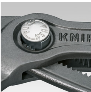
Fine adjustment by pushing a button: fast and comfortable.