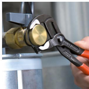
Fast and firm adjustment directly on the workpiece