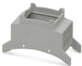
Installation component housing, Upper part, Color: light gray, Width: 35.6 mm, Constructional height: 62.2 mm

Please be informed that the data shown in this PDF Document is generated from our Online Catalog. Please find the complete data in the user's documentation. Our General Terms of Use for Downloads are valid ( http://phoenixcontact.com/download )