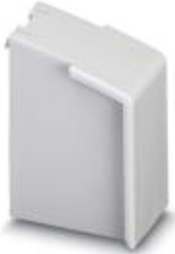
Component housing, Color: light gray

Please be informed that the data shown in this PDF Document is generated from our Online Catalog. Please find the complete data in the user's documentation. Our General Terms of Use for Downloads are valid ( http://phoenixcontact.com/download )