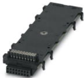
Plug component, Nominal current: 3 A, Number of positions: 16, Pitch: 2.54 mm, Color: jet black

Please be informed that the data shown in this PDF Document is generated from our Online Catalog. Please find the complete data in the user's documentation. Our General Terms of Use for Downloads are valid ( http://phoenixcontact.com/download )