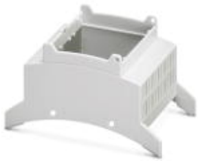
Installation component housing, Upper part, Color: light gray, Width: 53.6 mm, Constructional height: 62.2 mm

Please be informed that the data shown in this PDF Document is generated from our Online Catalog. Please find the complete data in the user's documentation. Our General Terms of Use for Downloads are valid ( http://phoenixcontact.com/download )