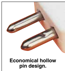
Economical hollow pin design.

We make running changes when technical advances allow. Check at time of ordering for additional features.