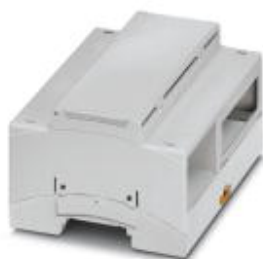
DIN rail housing for Raspberry Pi computers (suitable for Raspberry Pi A+, B+, B2, B3); set consisting of lower part, upper part, cover, and PCB holder; housing according to DIN 43880

Please be informed that the data shown in this PDF Document is generated from our Online Catalog. Please find the complete data in the user's documentation. Our General Terms of Use for Downloads are valid ( http://phoenixcontact.com/download )