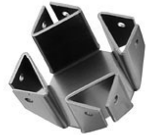
Representative Photo Only