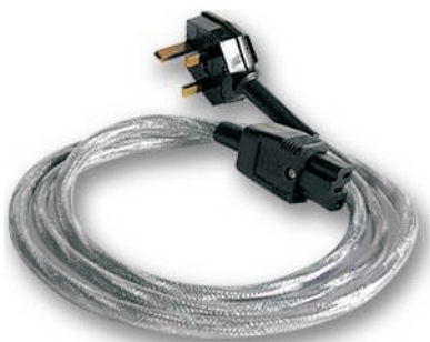
SC5689/BP 13Amp plug to IEC connector. Fused at 10 Amps 1.5mm sq. 3 core Double screened cable fitted with 13Amp MK plug top 1.5 metres long