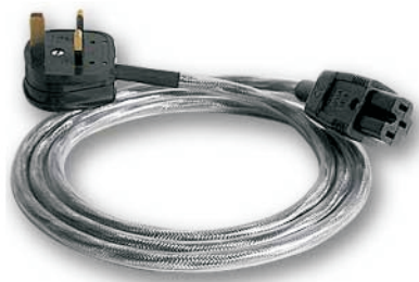
SC5688/BP 13Amp plug to IEC connector. Fused at 10 Amps 1mm sq. 3 core Double screened cable 1.5 metres long