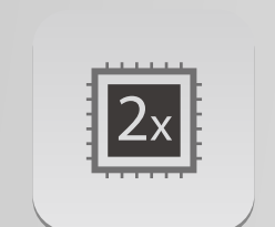
Dual-Core 1.4 GHz CPU