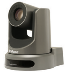
RealCam PTZ Camera

Thunder Speakerphone (INA-TH150): VoiceAware anti-echo & noise-reducing technology for any size meeting room