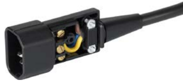
Example with assembled cable