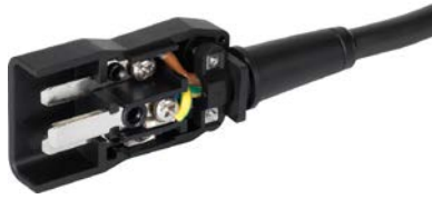
Example with assembled cable