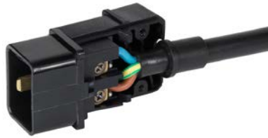
Example with assembled cable