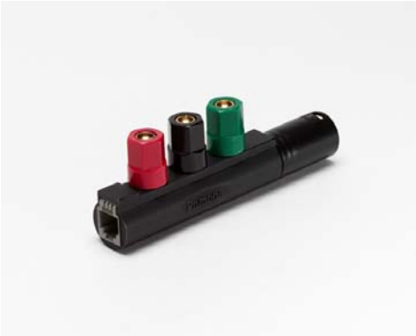
Model 7288 XLR (M) / Triple Binding Post / RJ11