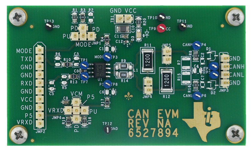
Figure 1. EVM PC Board

The CAN EVM has simple connections to all necessary pins of the CAN transceiver device, and jumpers where necessary to provide flexibility for device pin and CAN bus configuration. There are test points (loops) for all main points where probing is necessary for evaluation such as GND, V_{CC} , TXD, RXD, CANH, CANL, Pin 8 (mode pin), Pin 5 (various functions). The EVM supports many options for CAN bus configuration. It is pre-configured with two 120 \Omega resistors that may be connected on the bus via jumpers: a single resistor is used with the EVM as a terminated line end (CAN is defined for 120 \Omega impedance twisted pair cable) or both resistors in parallel for electrical measurements representing the 60 \Omega load the transceiver "sees" in a properly terminated network (i.e. 120 \Omega termination resistors at both ends of the cable). If the application requires "split" termination, TVS diodes for protection, or Common Mode (CM) Choke, the EVM has footprints available for this via customer installation of the desired component(s).