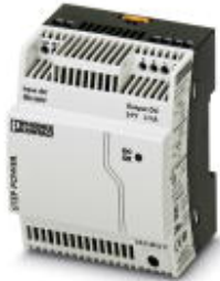
Primary-switched STEP POWER power supply for DIN rail mounting, input: 1-phase, output: 24 V DC/2.5 A

Please be informed that the data shown in this PDF Document is generated from our Online Catalog. Please find the complete data in the user's documentation. Our General Terms of Use for Downloads are valid ( http://phoenixcontact.com/download )