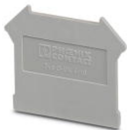
End cover, Length: 42.5 mm, Width: 1.8 mm, Height: 35.9 mm, Color: gray

Please be informed that the data shown in this PDF Document is generated from our Online Catalog. Please find the complete data in the user's documentation. Our General Terms of Use for Downloads are valid ( http://phoenixcontact.com/download )